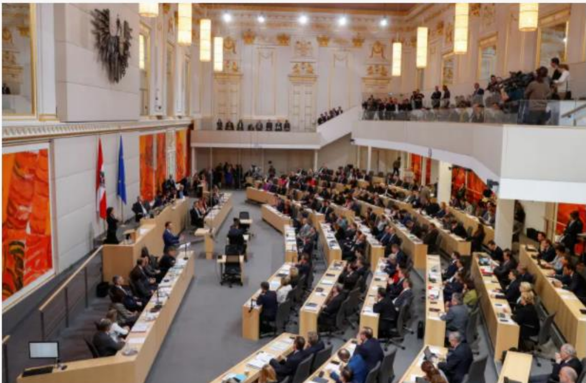
A general view of a session of the parliament in Vienna, Austria, January 10, 2020