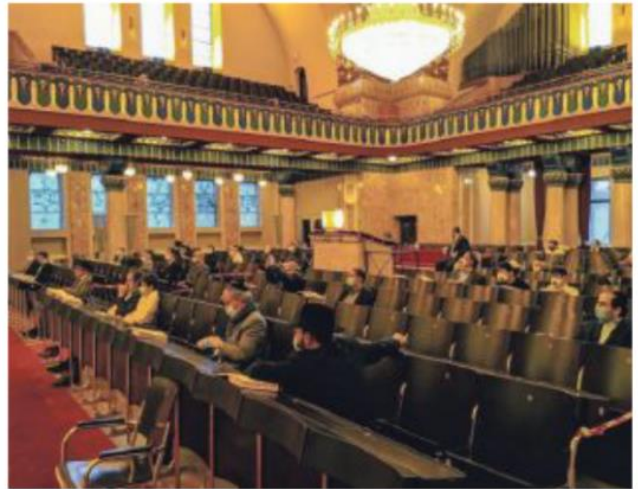
The Great Synagogue of Frankfurt