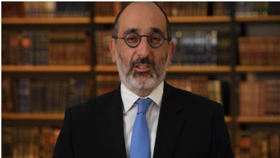
Calling for an 'unprecedented show of unity': Chief Rabbi Warren Goldstein of South Africa

Pray for humankind before lighting candles on Friday, 11 Chief Rabbis say