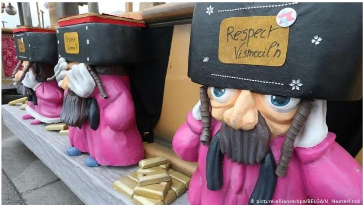
One of this year's floats featured Orthodox Jews next to gold bars

The US Holocaust Museum tweeted "24,000 Jews living in Belgium were murdered in the Holocaust. Today, deadly anti-Semitism is on the rise again throughout Europe. Events like the Aalst Carnaval parade that promote anti-Semitism and stoke hatred and potentially violence must be denounced by all segments of society."