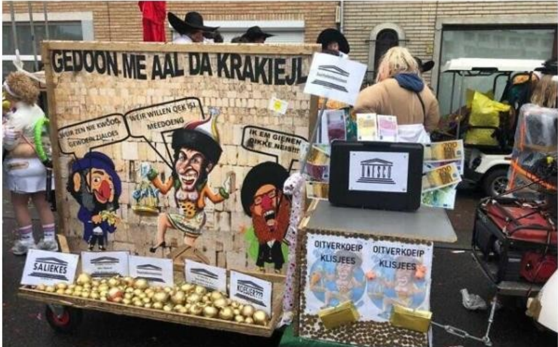
A display at the annual Aalst carnival in Belgium, February 23, 2020.

Last year, JTA reported that the Aalst carnival included effigies of grinning Orthodox Jews holding bags of money, with a rat perched on one effigy’s shoulders.