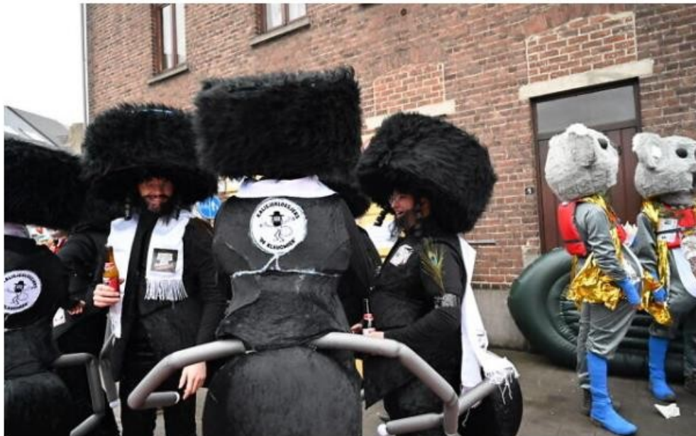
Participants of the Aalst Carnival wearing costumes combining ultra-Orthodox Jewish attire with ant limbs at the event in Aalst, Belgium on February 23, 2020.

AALST, Belgium (JTA) — Caricatures of Jews, including ones depicting them as ants, were prominently displayed at this city’s annual parade.