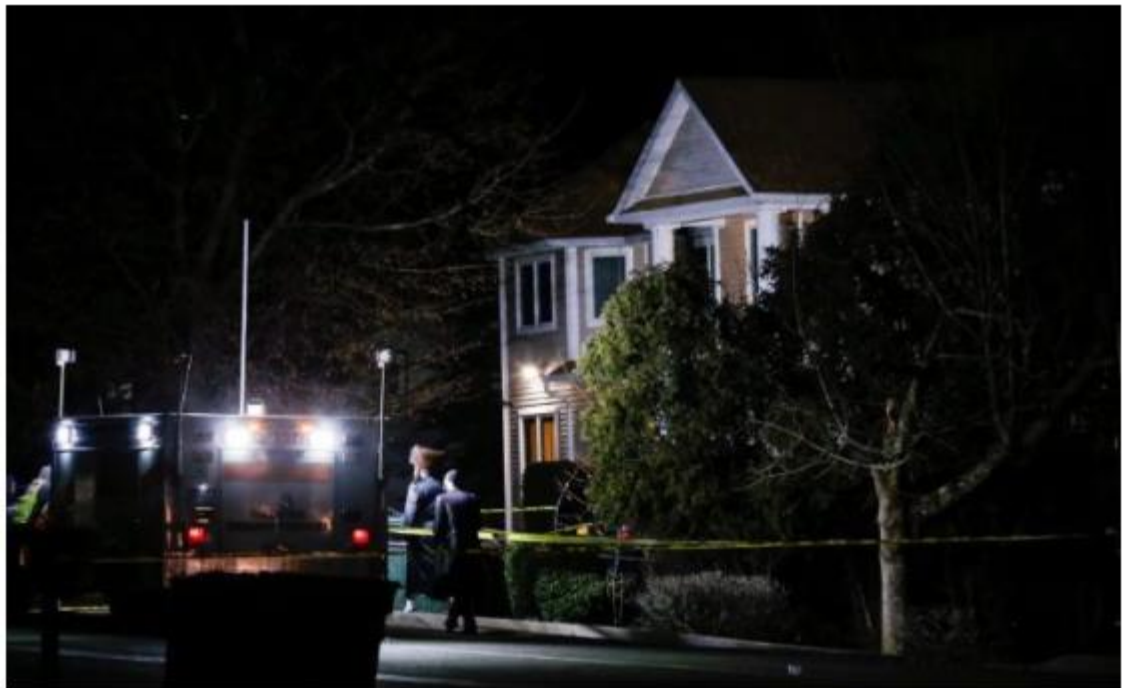
The scene in front of the house in Monsey near New York, where the attack occurred.