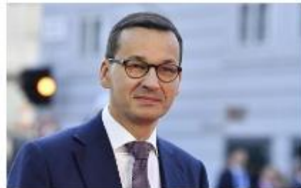
Polish Prime Minister Mateusz Morawiecki arrives at the informal EU summit in Salzburg, Austria, September 20, 2018.

After the court hearing, Poland's Ministry of Foreign Affairs released a statement condemning the altercation, saying "any such acts directed against diplomatic agents deserve unequivocal condemnation."