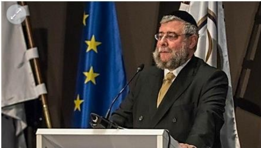
President of the Conference of European Rabbis Pinchas Goldschmidt

The baseline of the talks took place during a conference in Moscow last week, which gathered religious figures from all around the world.