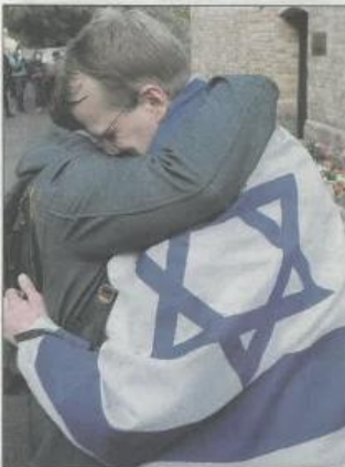
AGONY: Stunned and sobbing mourners hug after the attack

THE Yom Kippur shooting outside a German synagogue has been condemned around the world.