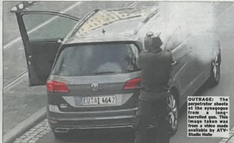
OUTRAGE: The perpetrator shoots from a long-barrelled gun.

Israeli foreign minister Israel Katz added