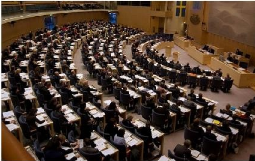
The Swedish Riksdag

Saying she regretted the party conference's vote, she insisted the Center Party, which holds 31 out of 349 seats in the Riksdag, the Swedish parliament, was committed to "standing up for minorities in Sweden and their opportunity to live here," according to Expressen.