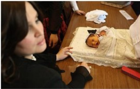
Illustrative: A brit, or Jewish circumcision ceremony, in Berlin, Germany.

"The Swedish Center Party's decision to promote a ban on religious circumcision is a request for Jews to leave Sweden, the most liberal of EU states. We mourn the lack of tolerance and loss of diversity in today's Sweden," he said.