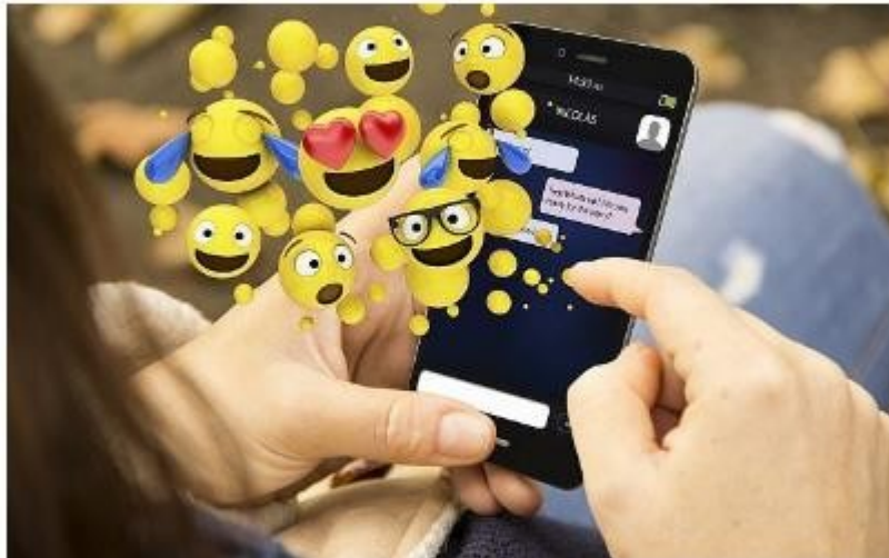
Illustrative - Emoji use on a smartphone.

European Jewish rabbis have petitioned the official world body that regulates and approves emojis, calling on them to add ideograms that represent the Jewish faith.