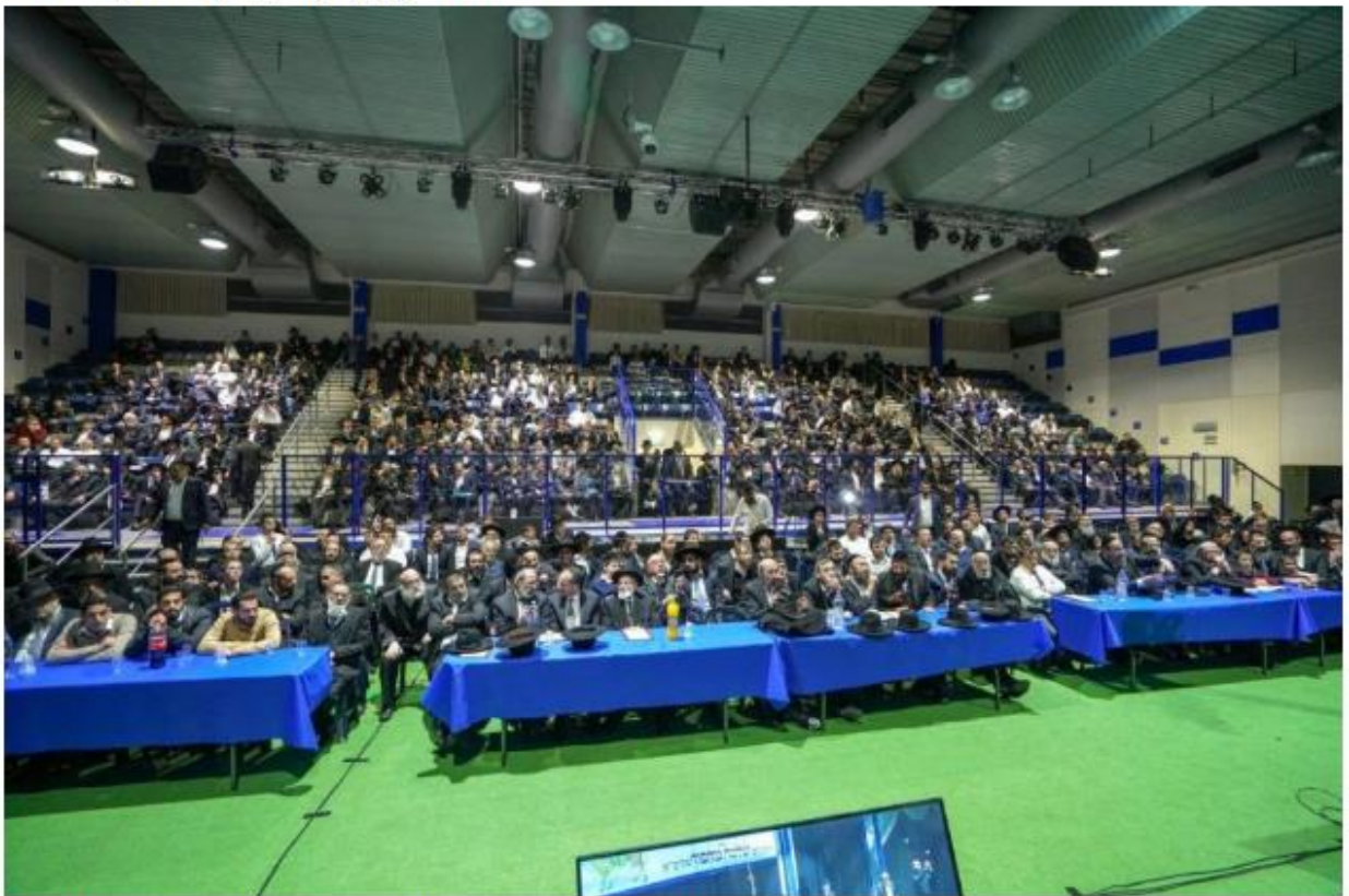
A view of the crowd at the shiur demonstrating hilchos shechitah in Bnei Brak.

Wednesday, February 27, 2019 at 5:55 am | כ"ב אדר א' תשע"ט