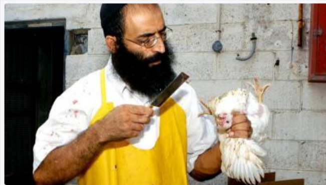
A hearing was held on Thursday at the Constitutional Court of Belgium in a lawsuit challenging prohibitions on the ritual slaughter of animals in two regions of the Western European nation. (Illustrative)

A hearing was held on Thursday at the Constitutional Court of Belgium in a lawsuit challenging prohibitions on the ritual slaughter of animals in two regions of the Western European nation.