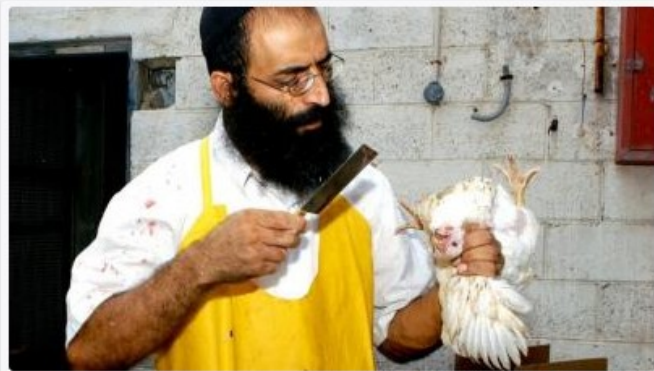
A hearing was held on Thursday at the Constitutional Court of Belgium in a lawsuit challenging prohibitions on the ritual slaughter of animals in two regions of the Western European nation. (Illustrative)

A hearing was held on Thursday at the Constitutional Court of Belgium in a lawsuit challenging prohibitions on the ritual slaughter of animals in two regions of the Western European nation.