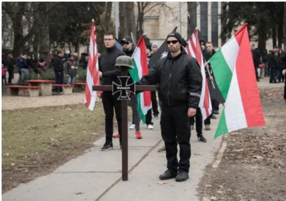
One of the neo-Nazi marches in Budapest, Hungary.

J ewish leaders in Hungary have spoken out against the failure of the government and police to stop the neo-Nazi marches which took place last Saturday in the capital of Budapest, drawing an estimated 2,800 far-right extremists bearing swastikas and other fascist symbols.