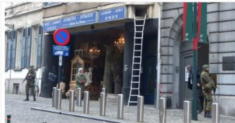
Jan. 2015: Two Belgian soldiers stand outside the Jewish museum in Brussels where an Islamist had killed four people in May 2014.

embassies to Jerusalem, learning from Israel's security services, and protecting Israel's interests within the European Union. Geert Wilders of the Netherlands lived in Israel for a year and subsequently visited it dozens of times. That Europe's Jews live more safely where civilizationists impose strict controls on migration only reinforces Israeli appreciation; as Evelyn Gordon notes, in 2017, "Hungary's 100,000 Jews didn't report a single physical attack, while Britain's 250,000 Jews reported 145."