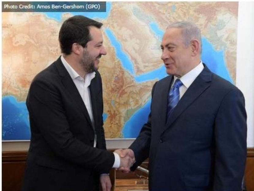
Prime Minister Benjamin Netanyahu met with Italian Deputy Prime Minister and Minister of the Interior Matteo Salvini, December 12, 2018

{Originally posted to the author's website }