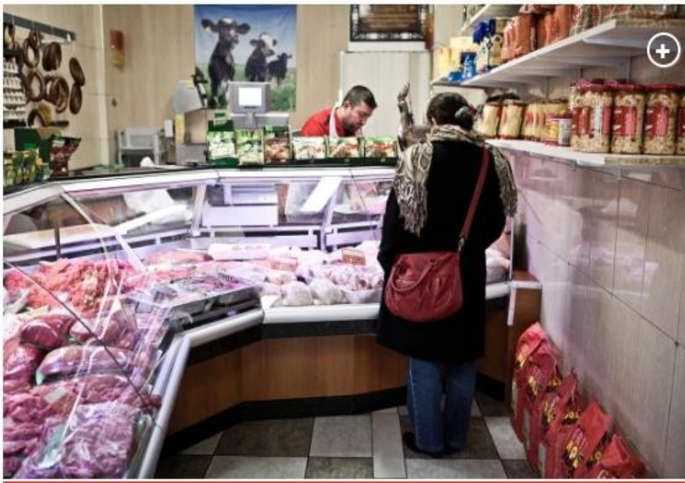
Butchers inside the Kasap Mehmet butchery near the Annasr Mosque in Vilvoorde, Belgium.