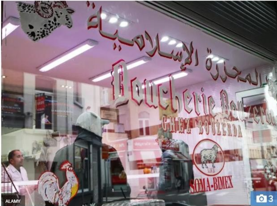
Most butchers in Brussels sell only halal meat, a survey found

Much of Europe's halal meat comes animals that are stunned before their throats are slit.