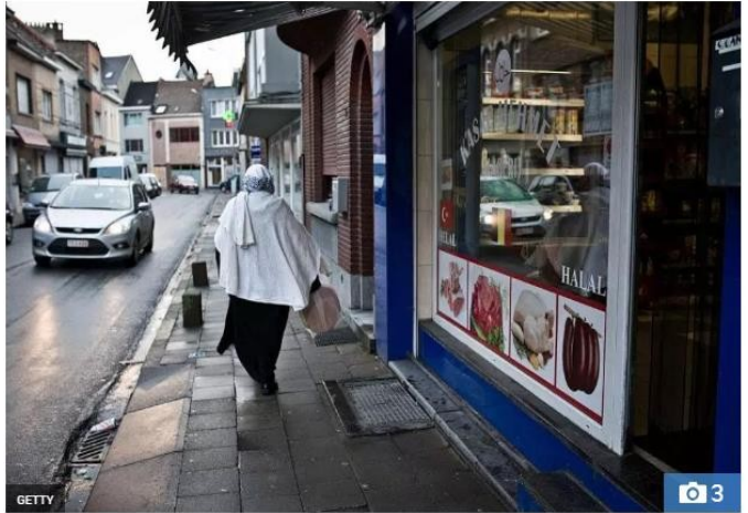
New laws make it illegal to produce halal and kosher meat but it will still be available in shops

A survey last year found most butchers shops in the Belgian capital sell only halal meat.