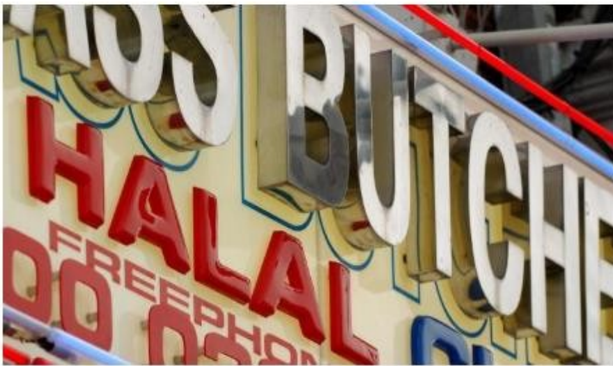
It is now illegal to produce halal and kosher meat in the Flanders region of Belgium