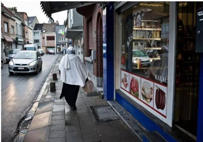
New laws make illegal for halal and kosher meat to be produced in most parts of Belgium

Belgium is home to about 500,000 Muslims and more than 30,000 Jews. Here's what you need to know about halal and kosher in the country.