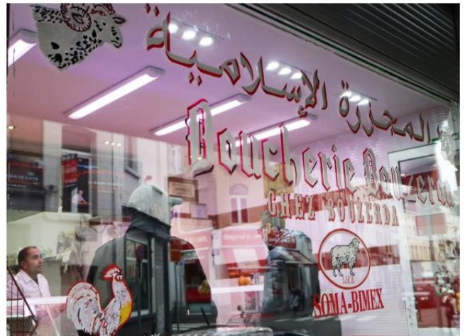
Most butchers in Brussels sell only halal meat, a survey found

Only the Brussels region, which has a large Muslim population, escaped the ban.