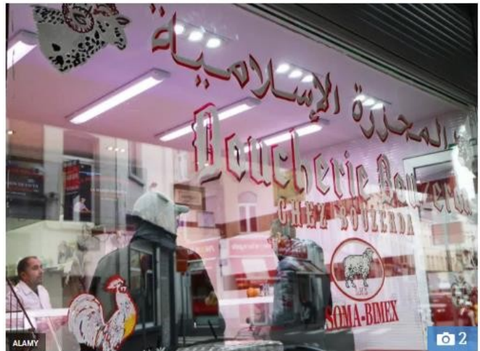
Most butchers in Brussels sell only halal meat, a survey found

Only the Brussels region, which has a large Muslim population, escaped the ban.