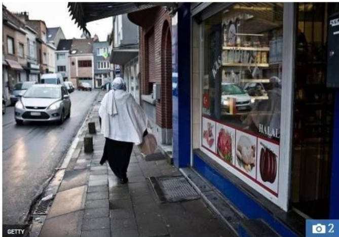
New Laws make illegal for halal and kosher meat to be produced in most parts of Belgium

Belgium is home to about 500,000 Muslims and more than 30,000 Jews. Here's what you need to know about halal and kosher in the country.