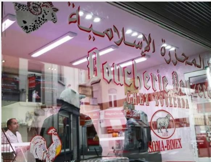
Most butchers in Brussels sell only halal meat, a survey found