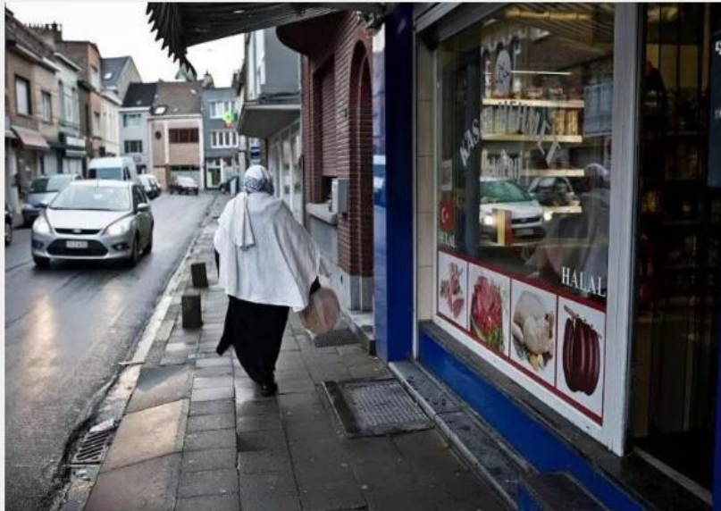
New laws make it illegal to produce halal and kosher meat but it will still be available in shops

A survey last year found most butchers shops in the Belgian capital sell only halal meat.