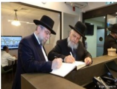
Signing the guest book.

Following that, the Rabbanim affixed mezuzos to newly appointed private offices that will house dozens of entrepreneurs and business owners who have joined Achim, among them international businesses in diverse industries such as food and beverage, tourism, marketing, import and export, high-tech and more. The visit was capped by a lavish lunch sponsored by the Bnei Brak Municipality, in recognition of Achim's contribution to the economy.