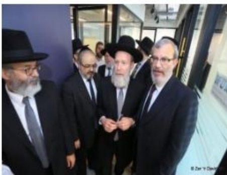
The Rabbanim at Achim Global Center.