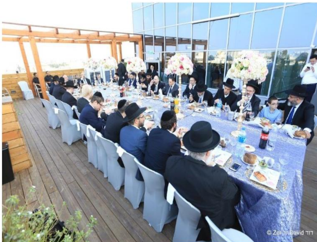
Delegates of the Conference of European Rabbis meet with Achim Global in Bnei Brak.

By Hamodia Staff | Tuesday, November 27, 2018 at 5:16 am | י"ט כסלו תשע"ט